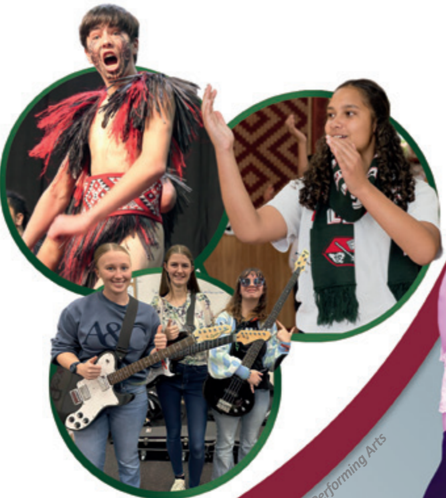
Productions: Grease, High School Musical, Rock of Ages, Little Shop of Horrors

Te Awhiorangi, our Kapa Haka group, has built a powerful reputation throughout the region. The group has represented the community at many civic events and also performs with distinction at Kapa Haka competitions. Māori performing arts is also an NCEA subject available to students.