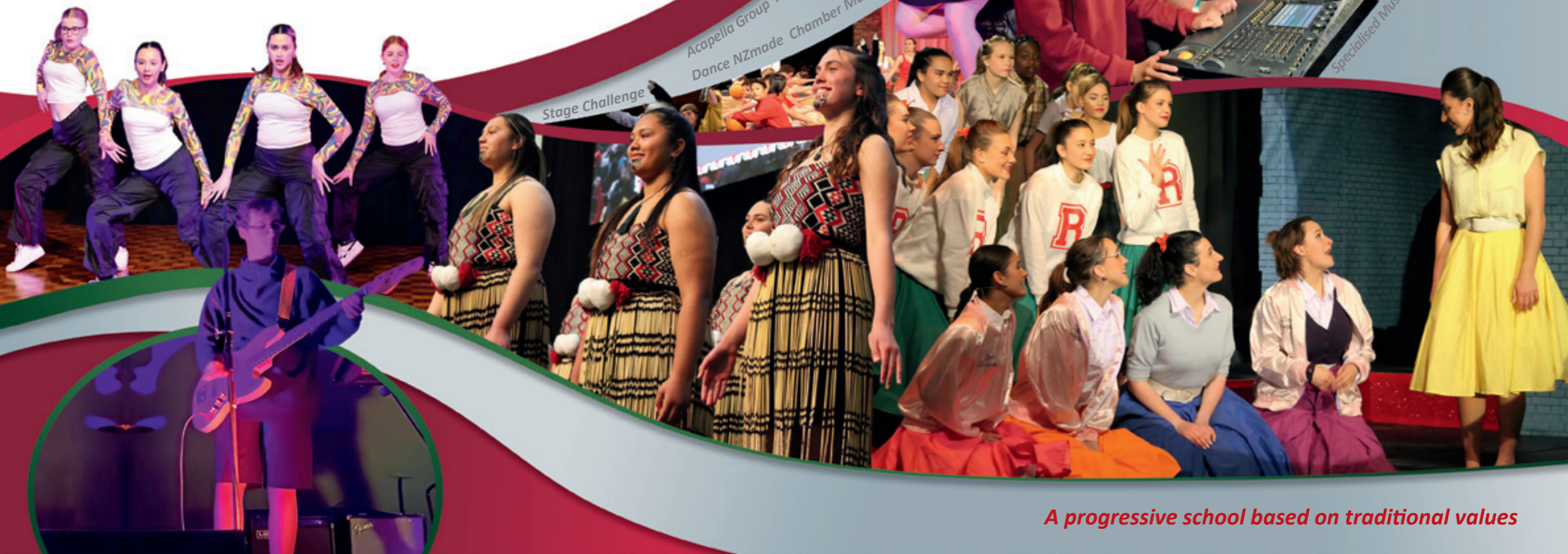
Specialised Music Tuition